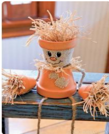
Create a friendly DIY fall project with terra-cotta pots, straw, and a few simple accessories!