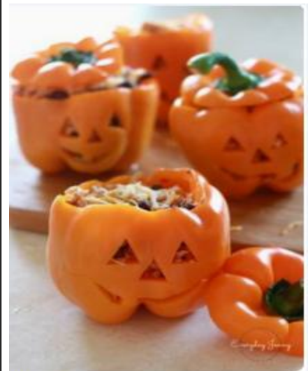
Stuffed peppers with shredded chicken, black beans and Mexican rice. Great for a Halloween dinner. Recipe at everydayjenny.com