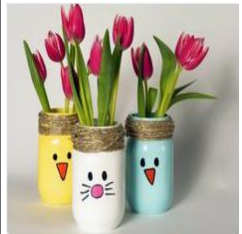
Mason jar craft will make your table, mantel Easter ready