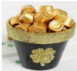
DIY POT OF GOLD BY CREATE CRAFT LOVE AT THE 5TH AVENUE

Melt butter & olive oil in a large skillet over medium heat. Stir in garlic & shallots, & cook for 1 to 2 minutes. Stir in asparagus spears; cook until tender, about 5 minutes. Squeeze lime over hot asparagus, & season with salt and pepper. Transfer to serving plate & garnish with lime wedges. Try it with Havarti, shaved Parmesan or Swiss cheese melted on top! From Allrecipes.com